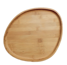
Yayoi Small Tray