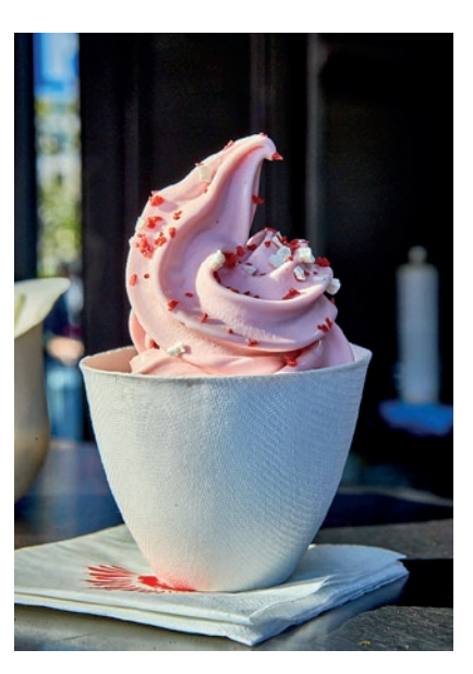
GOXO BY DABIZ MUNOZ ***