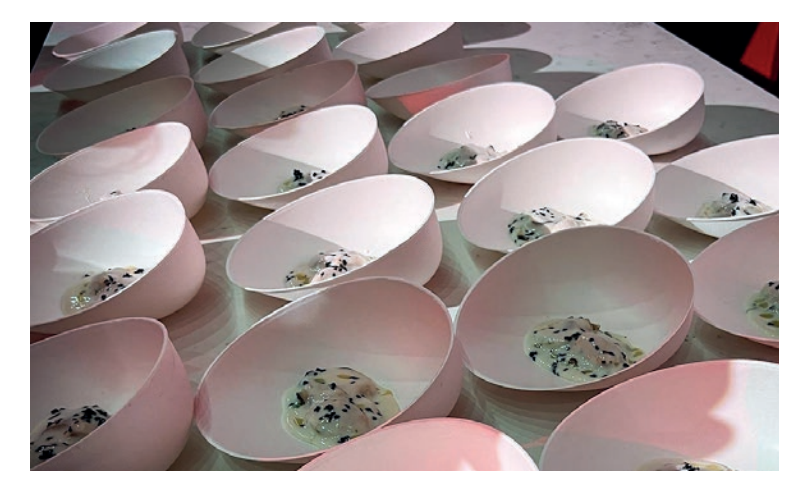
GALA MICHELIN STARS 2022 BY QUIQUE DACOSTA*** DISFRUTAR BARCELONA ***