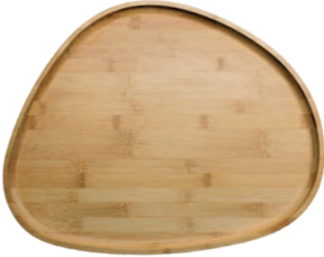
Yayoi Big Tray