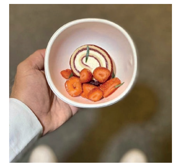
AKRAME. PARIS *