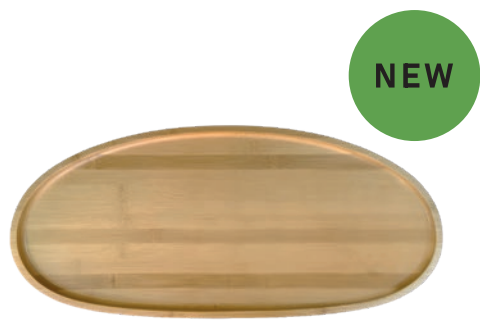
Yayoi Catering Tray