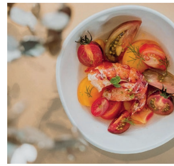
INTERCONTINENTAL HOTEL. FRANCE