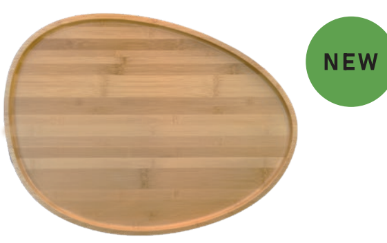
Yayoi XL Tray