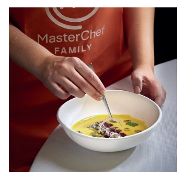
MASTER CHEF FAMILY AT HOME