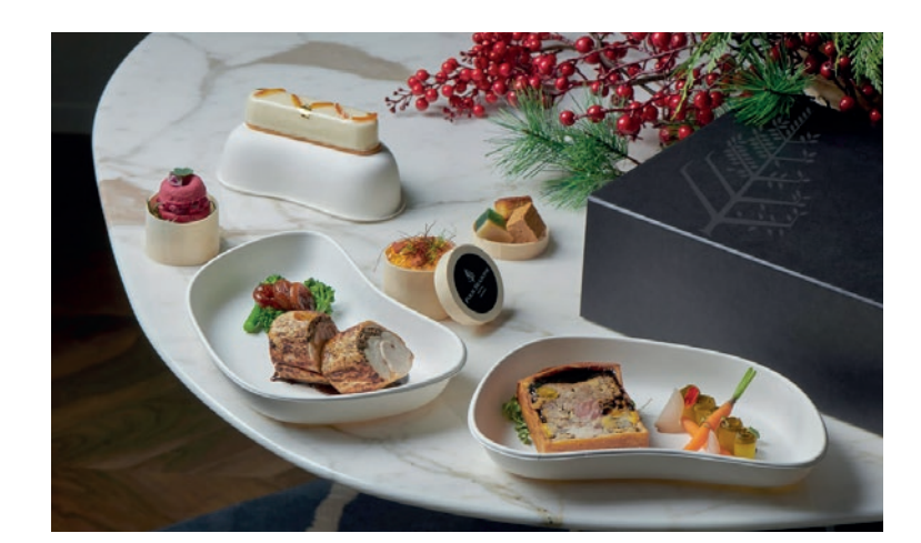
FOUR SEASONS HOTEL. MADRID