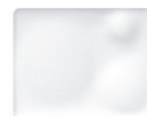
The Tablet 25 x 20.5 x 1.5