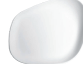
Yayoi Flat 23 x 20 x 3.5