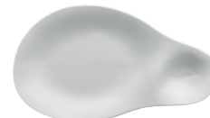
Tears Duo 34.5 x 20.5 x 2.3 cm