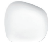
Yayoi Superflat 26 x 24.5 x 4