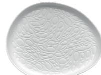
REX L 29.5 x 24 x 2.5