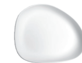
Yayoi Deep 19 x 16 x 4